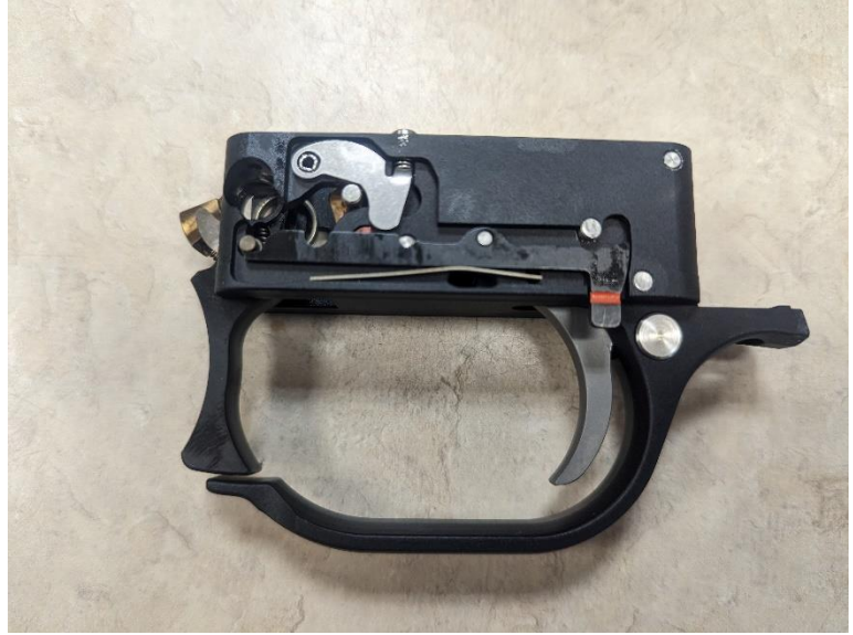
Torsion spring legs