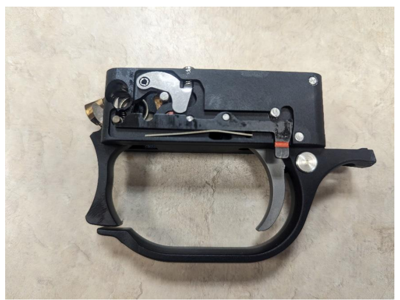
Torsion spring legs